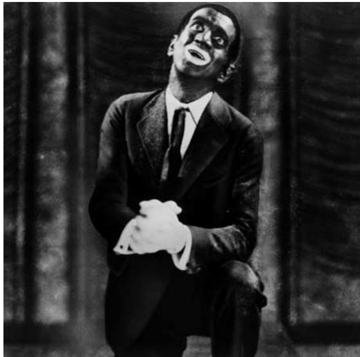
[Al Jolson, 'The Jazz Singer' — the first (full length) talking movie — 1927 : ]

Like the Mother Church, Europocentric idealism is an illusion of order. A nonsensical allegory that exists only to give us a satisfying, emotive explanation as to why the ugly brutality of European hegemony should be accepted as the price one must pay to achieve 'civilisation'. John Howard Griffin, the American author of 'Black Like Me' pointed in the preface of his ground-breaking book: