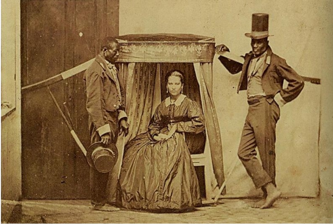
[Wealthy woman in 'carrying basket' and her attendant slaves, Brazil. ]

'...And one day we must ask the question, "Why are there forty million poor people in America?" And when you begin to ask that question, you are raising questions about the economic system, about a broader distribution of wealth. When you ask that question, you begin to question the capitalistic economy. And I'm simply saying that more and more, we've got to begin to ask questions about the whole society...'